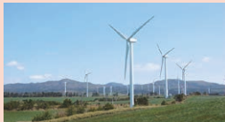
Futamata Wind Power Station

Took a stake in Futamata Wind Development Co., Ltd.