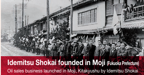
Idemitsu Shokai founded in Moji (Fukuoka Prefecture) Oil sales business launched in Moji, Kitakyushu by Idemitsu Shokai