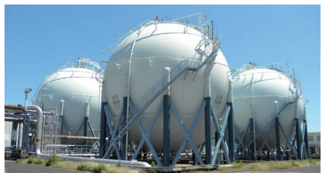
LPG tanks with reinforced support structures (Tokuyama Complex)

In FY2019, we reinforced our facilities at refineries, complexes and oil depots by employing subsidy programs offered by the government under the banner of building national resilience. Looking ahead, our group will consider the further enhancement of earthquake resistance.